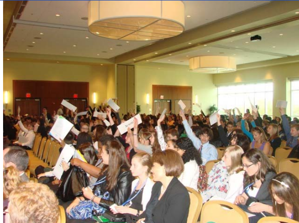
UNA-USA Global Classrooms Model UN Conference, USF Marshall Center, March 24, 2010